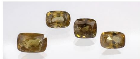
Figure 3: These garnets (0.68–0.99 ct) from Mogok, Myanmar, were identified as hessonite.

The GemmoRaman-532SG identified all of them as grossular, and their colouration was fairly consistent with the hessonite variety. Energy-dispersive X-ray fluorescence (EDXRF) chemical analysis with an Amptek X123-SDD spectrometer revealed the expected high levels of Ca and Fe, with minor Mn, Ti and Cr. All samples were inert to long- and short-wave UV radiation, and exhibited some magnetic susceptibility (being just barely dragged by a magnet).