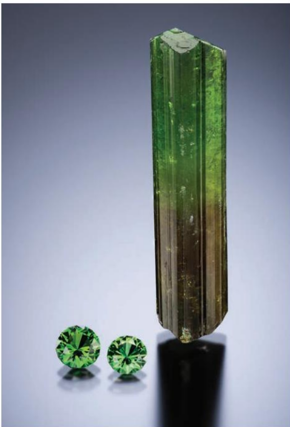
Figure 26: These faceted stones (1.09 and 0.70 ct) and crystal (4.7 cm tall) consist of dravite that was recently produced from Simanjiro District in Tanzania.

'Chrome tourmaline' is well known from East Africa (e.g. Sun et al., 2015), and in mid-2016 a significant new discovery occurred at the Commander mine in Simanjiro District, Manyara Region, north-eastern Tanzania. These tourmaline crystals first appeared on the market at the October 2016 Munich Show (Moore, 2017), and additional material was offered at the February 2017 Tucson gem shows. According to rough stone dealer Steve Ulatowski, the mine is located about 14 km from Nadonjugin village and was initially explored in 1997, but was soon abandoned. In late August 2016, a local miner referred to as 'Commander' reopened the deposit. He extended the previous workings by hand digging and blasting to ~12 m depth, where he found a large pocket that produced ~5 kg of mixed-grade crystals. A subsequent pocket was recovered that yielded an additional ~3 kg of tourmaline. The crystals were well formed with lustrous faces and ranged up to 10+ cm long. They typically were bicoloured with yellowish