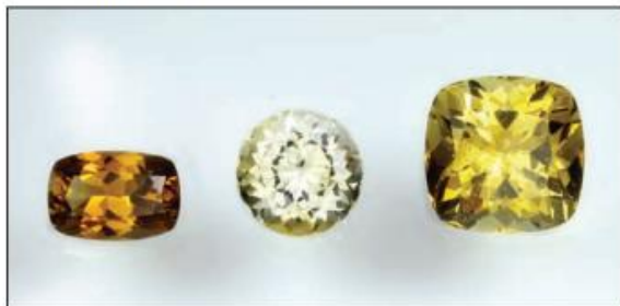
Figure 1: These rare faceted barytes (2.27–7.90 ct) show the range of colour of material from South Dakota.