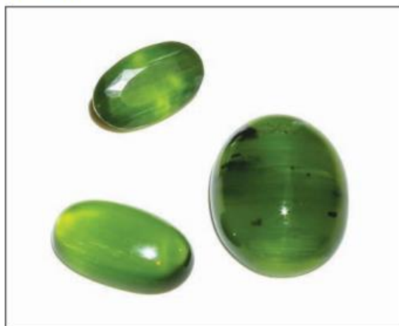
Figure 1: These green gems (3.71–16.77 ct), reportedly from a relatively new deposit in Pakistan, proved to be antigorite serpentine. The largest stone shows a faint cat's-eye effect.

Further testing of the polished stones revealed spot RI values of approximately 1.56, and hydrostatic SG measurements ranged from 2.59 to 2.60, typical of serpentine. The lustre of the gems ranged from sub-vitreous to silky, which is consistent with the variable low Mohs hardness of antigorite (2½–4, rarely up to 6; Gaines et al., 1997). The samples were inert to long- and short-