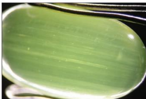
Figure 2: Abundant parallel linear inclusions are present in this 6.29 ct antigorite cabochon.

The antigorite described in this report shows some similarities to a cat's-eye serpentine from an unspecified origin documented by Choudhary (2009), except that stone fluoresced weak yellow