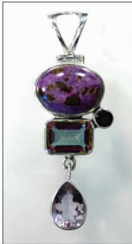
Figure 23: This pendant containing a 13 × 18 mm-wide cabochon of stichtite was submitted to Stone Group Laboratories in mid-2016. It also is set with pale amethyst, CVD-coated colourless quartz and black onyx, in sterling silver.

At the 2016 Tucson gem shows, rare-stone dealer Mauro Pantò had approximately 50 nearly monomineralic faceted stichtites (~1.0–2.5 ct) from South Africa. Two regions in South Africa are known to produce stichtite, in Limpopo