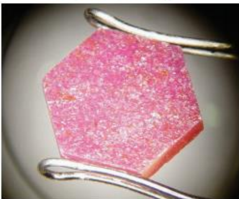
Figure 23: Seen here in oblique lighting, the 3.32 ct ruby shows a granular texture with orangey red domains corresponding to rutile inclusions.

Braunwart loaned the sample in Figure 22 for examination. It consisted of a polished hexagonal plate weighing 3.32 ct and measuring 10.16 × 1.96 mm. It was a dull but saturated dark red (World of Color 2.5R3/6, Dark Red) with slight to moderate