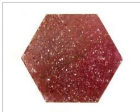
Figure 22: This polished hexagonal plate (3.32 ct) of ruby from Liberia displays abundant sparkles in reflected light that are due to reflections from rutile inclusions and polycrystalline grain boundaries.