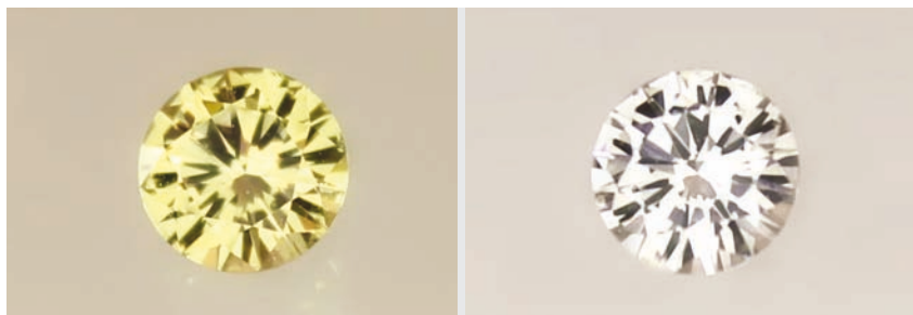
Figure 25: This 1.07 ct sapphire shows an unusual 'reverse' colour change. The more stable yellow state fades to colourless after low-temperature heating, and the yellow colour can be restored by exposure to long-wave UV radiation or daylight.

Inc., Lafayette, Louisiana, USA, reported that they sold a 1.07 ct white sapphire to a retailer who returned the stone after it turned yellow. The client mounted the white sapphire into a ring, and sold it to a consumer who wore the ring for a few months before returning it to the retailer. Stuller immediately exchanged the stone for another comparable white sapphire, but the question remained of how and why the change in coloration occurred.