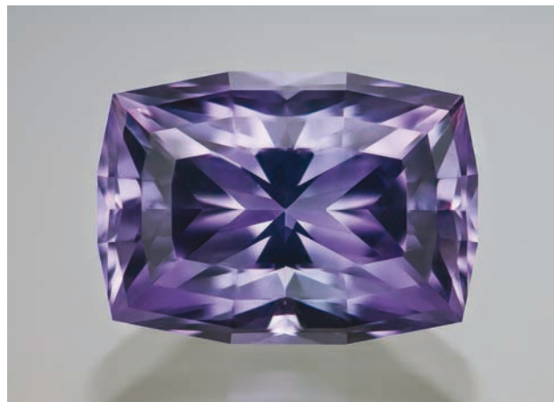
Figure 5: Weighing 7.27 ct, this eye-clean cushion brilliant is unusually large for purple apatite from Namibia.

to deep purple; some of them had a slight grey overtone. So far, most of the gems weigh <2 ct (eye clean to very slightly included), and only four eye-clean stones weighing >3 ct have been cut, including a top-colour 3.51 ct oval and a 7.27 ct