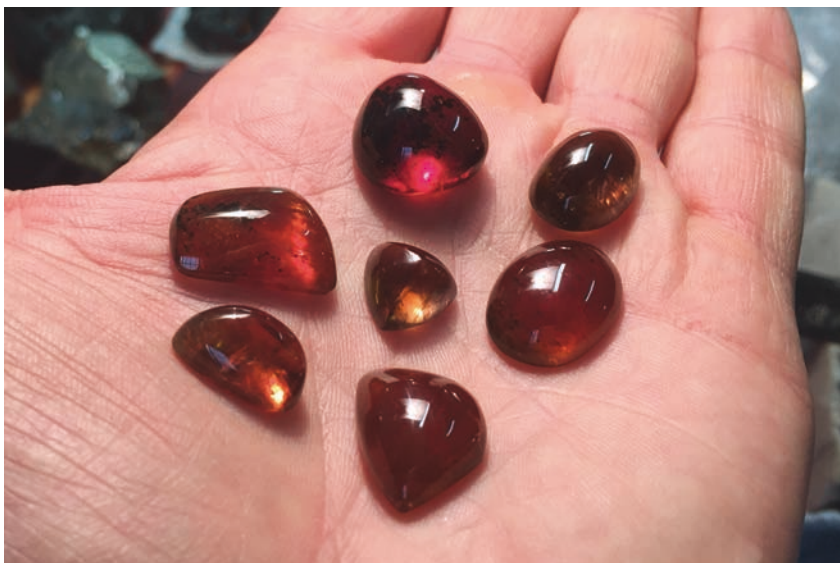
Figure 6: Cabochons cut from the new Madagascar cordierite show unusual orange-red to yellowish brown coloration. The total weight of the stones shown here is 45.18 ct.

could clearly be observed with the naked eye, resulting in an overall dark, slightly brownish orange-red or yellowish brown depending on the viewing angle. RI values varied between 1.530 and 1.540, with n_{\alpha} = 1.530 , n_{\beta} = 1.533\text{--}1.534 and n_{\gamma} = 1.540 , yielding a birefringence of 0.010. The optic sign was consistently biaxial positive, which differs from the common blue iolite (biaxial negative). Hydrostatic SG values were 2.53–2.55; these are at the low end of the known range for cordierite (2.53–2.78, cf. Deer et al., 1986). All samples were inert to long- and short-wave UV radiation. The stones were moderately included, mostly with partially healed fissures but also with irregularly shaped, breadcrumb-like inclusions and various mineral inclusions. Raman microspectroscopy using a Thermo DXR Raman microscope with 532 nm laser excitation identified the inclusions as follows: rounded and elongated—or thin, long prismatic—crystals of tourmaline; blocky and small rectangular-appearing grains of quartz; rounded crystals of apatite; a small platelet of phlogopite;