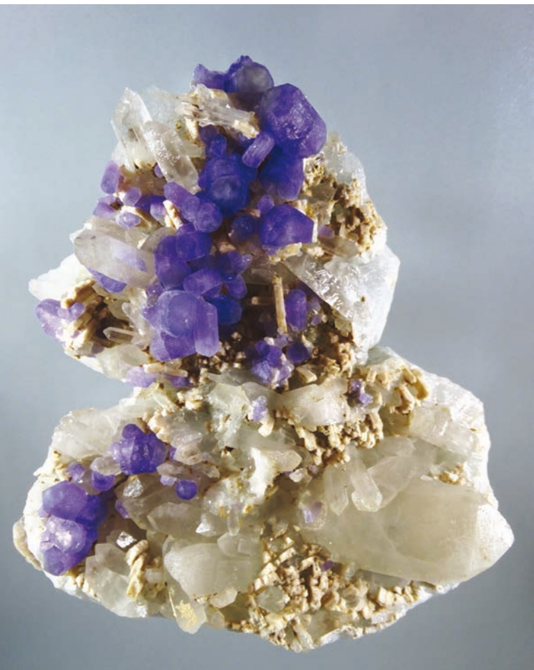
Figure 4: Deep purple apatite is associated with quartz and albite on this specimen (14 × 13 cm) from the Karibib area of Namibia.

to deep purple; some of them had a slight grey overtone. So far, most of the gems weigh <2 ct (eye clean to very slightly included), and only four eye-clean stones weighing >3 ct have been cut, including a top-colour 3.51 ct oval and a 7.27 ct