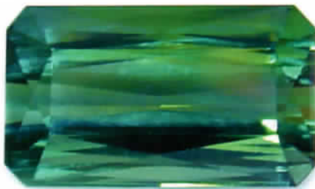
A natural Nigerian tourmaline weighing 16.72 carats. This tourmaline could be mistaken as synthetic based on Raman readings as described in this article.